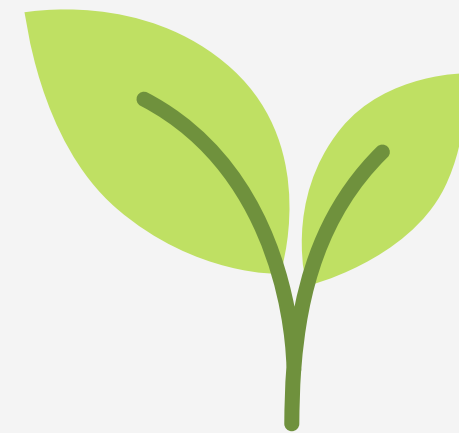
Environment & Climate Change